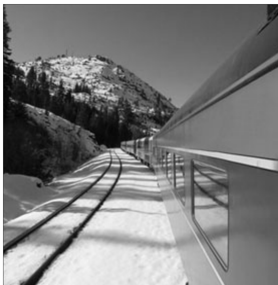
Reno Snow Train