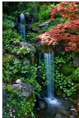
Hakone Gardens.