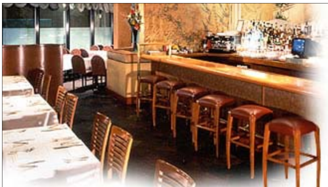
Illustration source: Crustacean

Cost: Please call Karla to make a reservation and remember to bring cash.