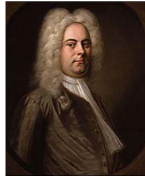
George Frideric Handel

Our primo opera expert will again present one-hour edited versions of two operas: Donizetti's Lucrezia Borgia and