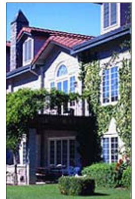
Byington Winery