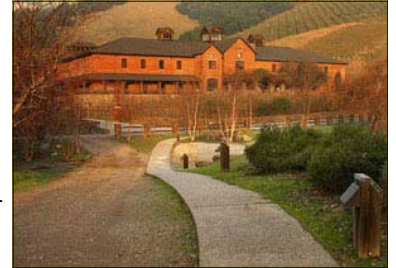
SkyWalker Ranch image

Upon accepting Tania's invitation, the initial treat is the drive to secluded SkyWalker Ranch in Marin county. It offers California countryside in all its glory; little vehicle traffic, gentle rolling hills, curving woodlands and fields almost devoid of "civilization."